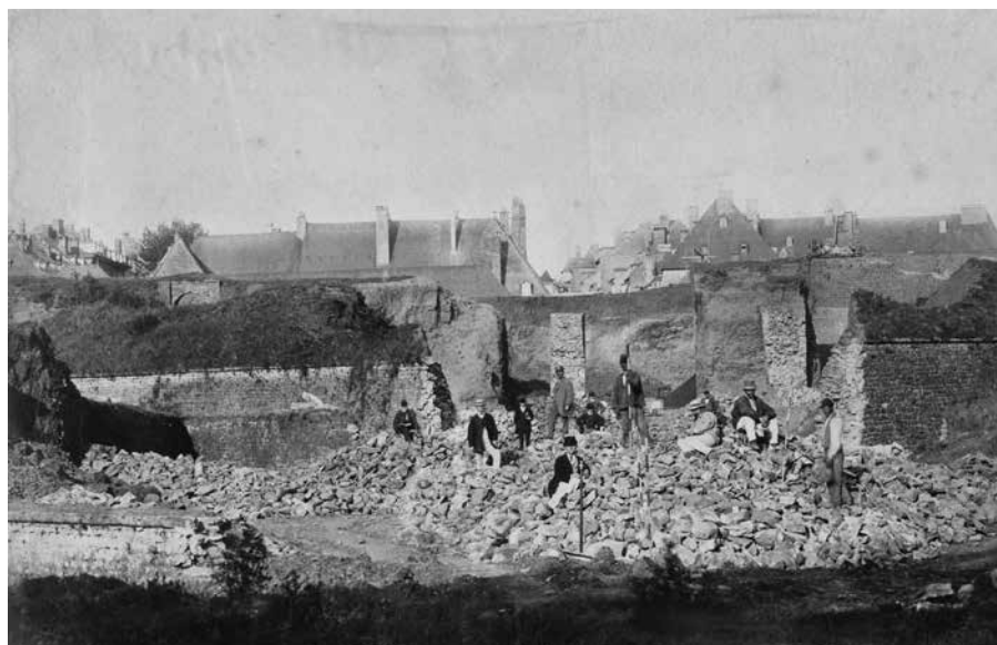
The dismantling of the fortress, which commenced in 1867 with the opening up of the major avenues, such as Avenue Monterey seen here, paved the way for the capital to become an open and dynamic city.