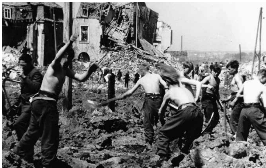
Clearing of a suburb in the capital after its bombardment in May 1944