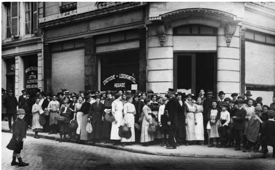
Distribution of eggs and sugar in the city of Luxembourg during the First World War, following the introduction of rationing by the government

carrying out secret negotiations, which risked having repercussions on the independence of Luxembourg. On 9 January 1919, the volunteer corps (Luxembourg army) revolted and a committee of public safety declared Luxembourg a republic. These movements did not garner public support and were swiftly stifled by the intervention of French troops. But the position of Grand Duchess Marie-Adélaïde was definitely compromised. The sovereign decided to abdicate in favour of her younger sister Charlotte, who succeeded her without delay (15 January 1919).