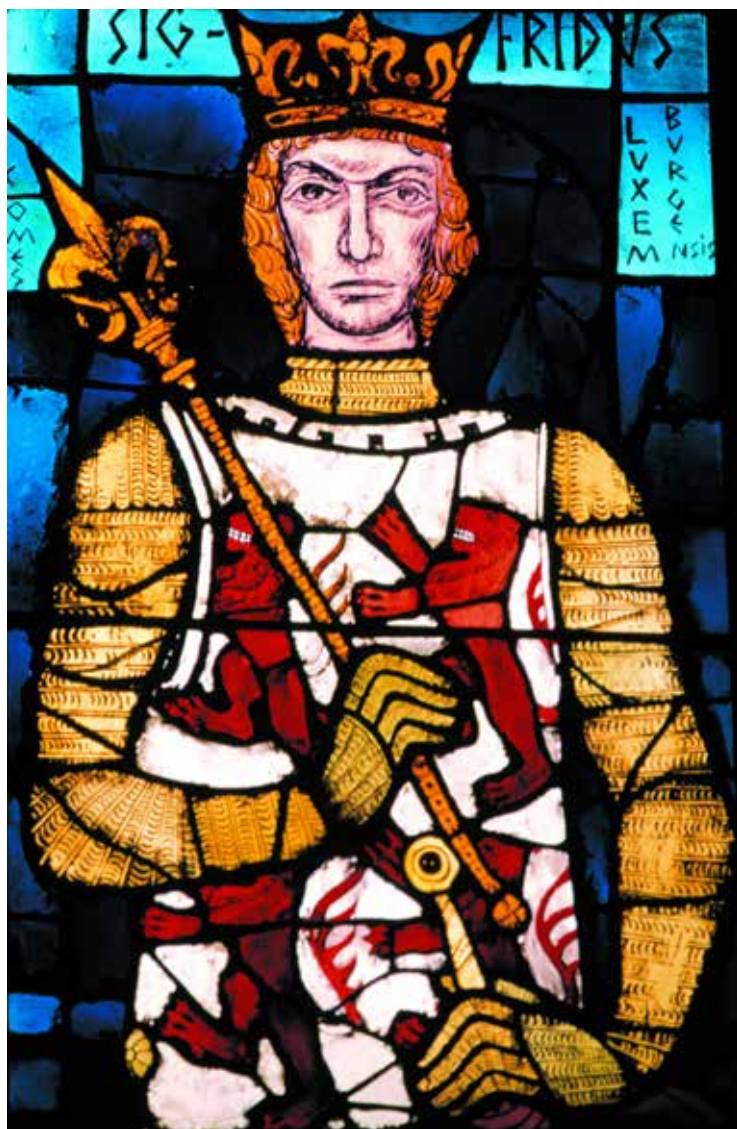
Stained-glass window of the cathedral of Luxembourg City depicting Count Siegfried