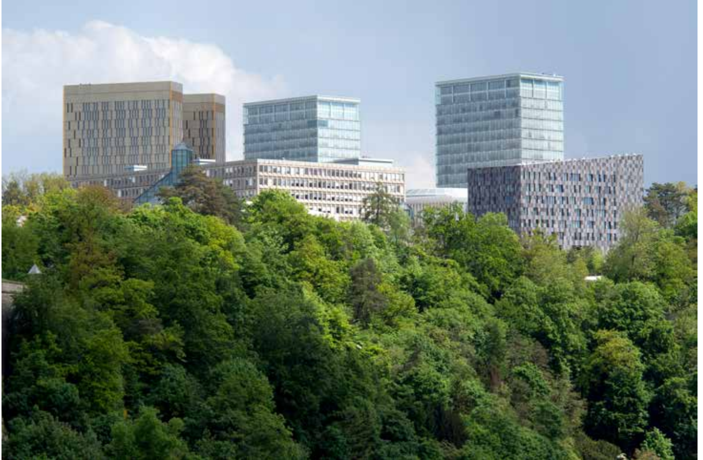
View of the dynamic European quarter of Kirchberg, with in the centre the two identical towers flanking the Porte de l'Europe and on the left those of the Court of Justice of the European Union