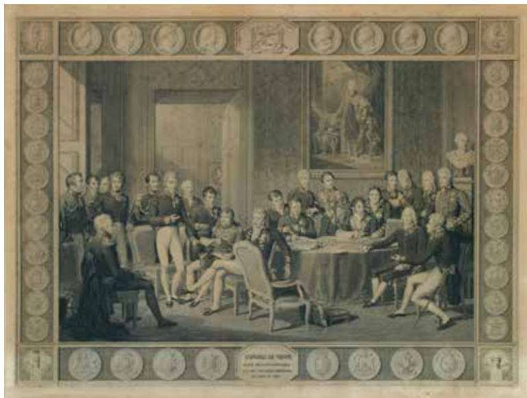
Engraving depicting the representatives of the powers gathered at the Congress of Vienna, who decided on the creation of the Grand Duchy of Luxembourg

In contrast to the two preceding centuries, the 18th century was marked by a period of peace in Luxembourg. The reigns of Charles VI (1715-1740), Maria Theresa (1740-1780) and Joseph II (1780-1790) brought about a revival in several areas. The Austrian reforms, such as the Theresian Land Register introducing fiscal equality and the Edict of Toleration granting non-Catholics the freedom of religion, already signalled the innovations of the French Revolution. In 1795, the French revolutionary troops conquered the fortress and Luxembourg was annexed to France as the Département des Forêts (Forests Department). The introduction of conscription, a system of compulsory military recruitment, triggered a peasant uprising in 1798, known as the "Klëppelkrich" (cudgel war). Under Napoleon, the more moderate French regime gained more widespread acceptance among the population.