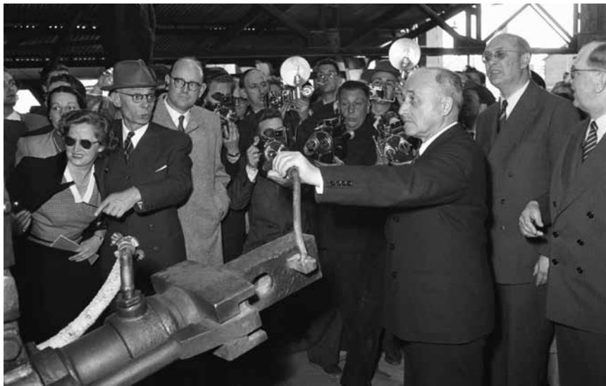
Jean Monnet, president of the High Authority of the European Coal and Steel Community (ECSC), activating the first European heat of steel at the Belval steelworks in Esch-sur-Alzette on 30 April 1953, the eve of the opening of the common market for steel

marked the end of the war. The final toll was high: as a result of the armed conflict and the Nazi terror, Luxembourg suffered 5,700 deaths, accounting for approximately 2% of the total population. The immediate postwar period was characterised by reconstruction. Thanks to the American aid received as part of the Marshall Plan, significant progress was achieved in terms of modernisation and infrastructure.