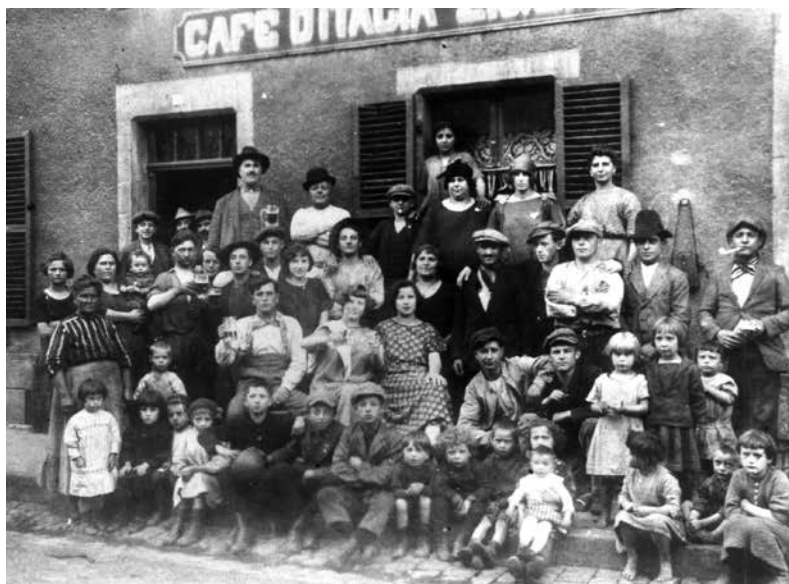
Italian immigrants outside Café d'Italia in Dudelange in the country's south, in the "Little Italy" neighbourhood built during the late 19th century

Industrialisation changed the demographic and social structures of the country. The farmers of the Oesling, the northern part of the country, abandoned their land to work in the mines and factories. Local labour, however, was not sufficient. From 1890 onwards, emigration practically stopped and Luxembourg became a country of immigration. Foreigners arrived in several waves: first the Germans, then the Italians and, more recently, from the 1960s onwards, the Portuguese. In 1910, immigrants already represented 15.3% of the total population. Today, they account for nearly 48%. The dependency on foreign countries regarding labour, but also capital and markets, has remained a permanent trait of the Luxembourg economy. When Luxembourg had to denounce the Zollverein just after the First World War, it formed an economic union with Belgium in 1921. Originally set up for a period of 50 years, yet regularly renewed thereafter, the Belgo-Luxembourg Economic Union (BLEU) established a permanent link between the two countries. The Belgian franc became the common currency, but Luxembourg nonetheless retained its right to issue Luxembourgish money.