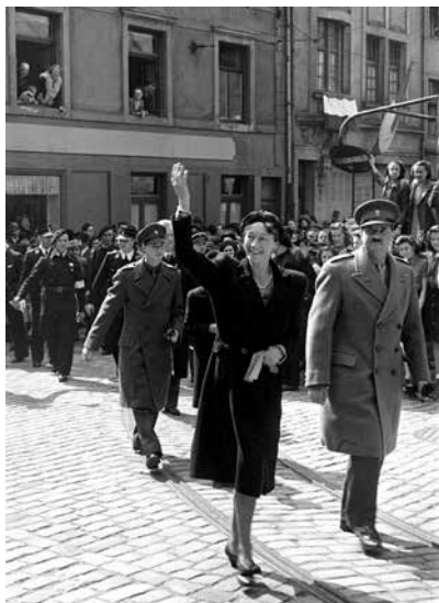
Grand Duchess Charlotte and Prince Félix, accompanied by Hereditary Grand Duke Prince Jean, in the streets of the capital in April 1945 following their return from exile