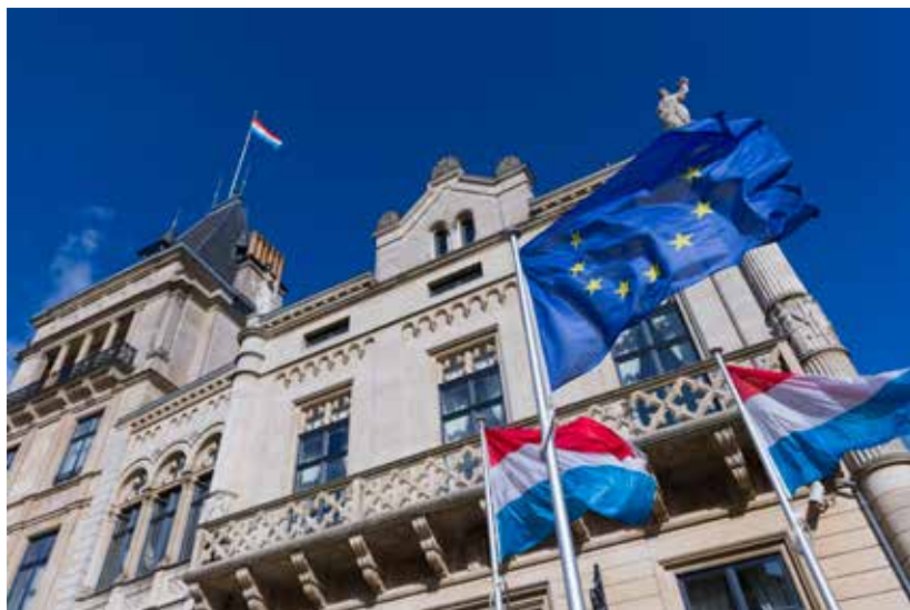
Luxembourg and European flags outside Parliament

Its small size did not prevent the Grand Duchy from playing an active role in the European construction. Prime Minister Pierre Werner (1913-2002) can be considered the forefather of the euro. Appointed head of a group of experts, he presented a monetary union project (Werner Plan) to the European Commission as early as 1970. The Schengen Agreement, abolishing border controls, bears the name of the Luxembourg village in which the first agreements were signed in 1985. Two Luxembourg statesmen, Gaston Thorn and Jacques Santer, presided the European Commission, from 1981 to 1985 and from 1995 to 1999, respectively; a third Luxembourger, Jean-Claude Juncker, has occupied the same post since 2014. From Joseph Bech (1887-1975) to Xavier Bettel (born in 1973), Luxembourg's politicians have excelled in the role of intermediary in European negotiations. The outcome of the 2005 referendum on the European Constitution (56.52% of votes in favour) revealed that the majority of Luxembourgers continue to support a deepening of European unity.