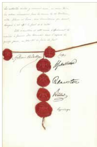
The Treaty of London was signed between France, Austria, Great Britain, Prussia and Russia on the one hand, and the Netherlands on the other hand.