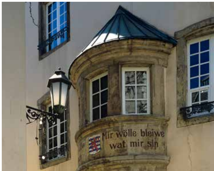
Inscription "Mir wëlle bleiwe wat mir sinn" on a façade in the capital, quoting an excerpt from the patriotic song Feierwon

The use of languages certainly played a major role in the construction of the nation. The 1839 split created the linguistic unity, since the Grand Duchy was reduced to its German-speaking part. Nevertheless, the law of 1843 on primary education made the learning of French compulsory, alongside German. The social elite remained in favour of the use of French and were intent on avoiding a linguistic separation from the working classes. All Luxembourg pupils have henceforth had to learn two languages: French and German. In everyday life, the Luxembourg people spoke their own Moselle-Franconian dialect, which right up until the end of the 19th century was referred to as Lëtzebuurger Däitsch (Luxembourgish German). At the end of the 19th century, with the national sentiment gathering in momentum and maturity, Luxembourgish ( Lëtzebuergesch ) asserted itself as the mother tongue of the Luxembourg people, rather than German. During the Second World War, the use of Lëtzebuergesch was to become the symbol of resistance and national cohesion. The occupier, pursuing its policy of forced Germanisation, tried to suppress its use. In 1984, a law ratified this secular trend by awarding Lëtzebuergesch the status of national language, without however calling into question the simultaneous use of French and German.