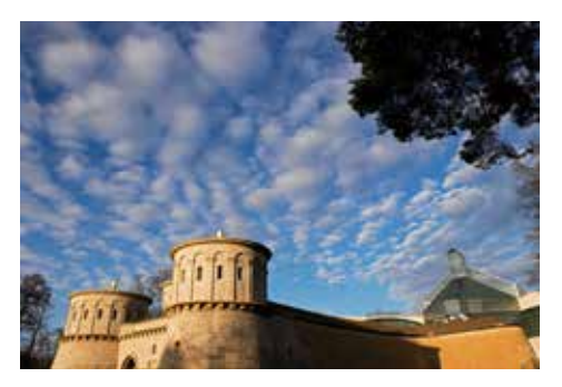
The Musée Dräi Eechelen with the Musée d'art moderne Grand-Duc Jean in the background