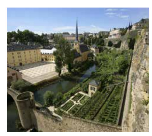
Grund quarter

The guarantees provided by the Treaty of London did not, however, prevent Luxembourg from being invaded by German troops in 1914. The occupation was restricted to the military sphere. The Luxembourg authorities protested against the German invasion, but demonstrated absolute neutrality towards the warring parties. Grand Duchess Marie-Adélaïde and the government remained in power, which was to have political repercussions in the aftermath of the First World War.