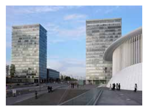
Kirchberg quarter

Luxembourg is seen as a model for openness and a microcosm of Europe with its population comprising 45.3% of foreign residents. The country's small size has enabled it to maintain an image of harmony "on a human scale".