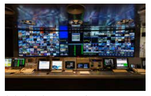
The digital network operations room of SES

In this context, in addition to a large number of small and medium-sized enterprises (SMEs), multinational names from the digital economy such as Amazon.com, eBay, PayPal, iTunes and Vodafone have also established themselves in the Grand Duchy. They confirm Luxembourg's position as a hub for companies operating in data processing, e-commerce and the communications sector in general.