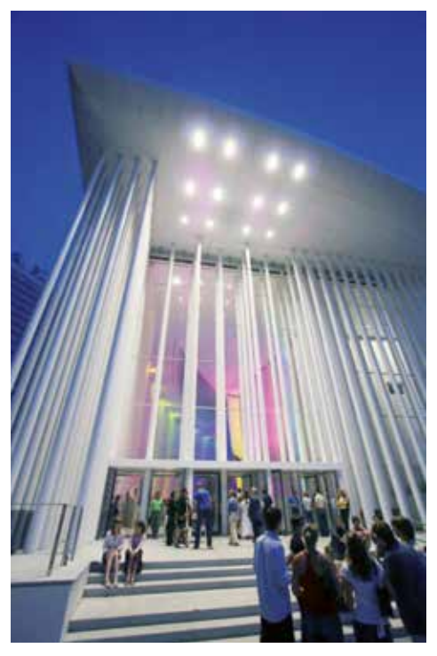
Philharmonie