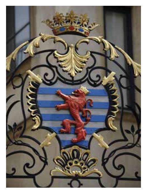
Coat of arms on the grand-ducal palace

The coat of arms has enjoyed legal protection under the law on national emblems of 23 June 1972, amended and supplemented by the law of 27 July 1993.