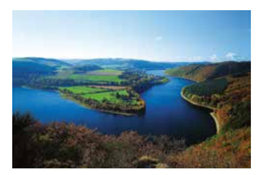
Haute-Sûre lake

There are slight variations in temperature, of around 2° C, between the north and south of the country due to the difference in altitude.