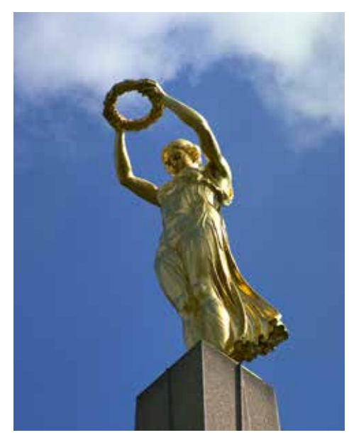
Gëlle Fra, symbol of the freedom and resistance of the Luxembourg people

After the country was liberated by the Allied troops in 1944, the Marshall Plan allowed for a major modernisation and infrastructure initiative.