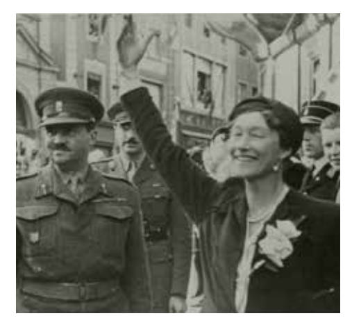
The Grand Duchess Charlotte in 1944

In September 1919, the Luxembourg government decided to organise a two-part referendum bearing both on the form of state (monarchy or republic) and on the economic direction of the country following the denunciation of the Zollverein. The population, which was enjoying universal suffrage for the first time, voted overwhelmingly in favour of the monarchy and an economic union with France. When France withdrew, the Luxembourg government forged an economic union with Belgium in 1921, the Belgo-Luxembourg Economic Union (BLEU). Luxembourg adopted the Belgian franc as the currency of the BLEU, while retaining a limited issue of Luxembourg francs.